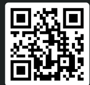
Download iGE App

Smart, Automated Energy Performance For Business